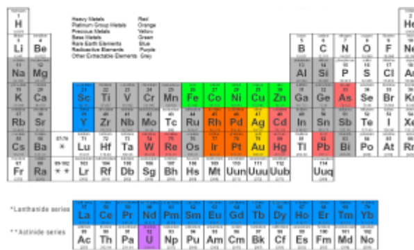
Metals We Extract